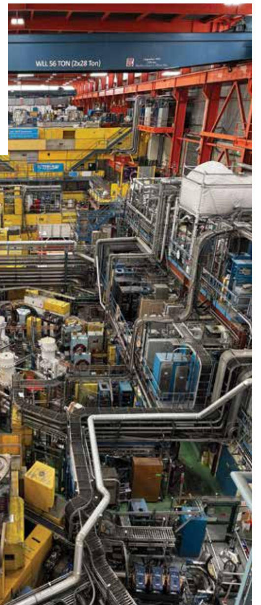
Inside the main experimental hall at TRIUMF - the yellow shielding blocks in the distance surround the cyclotron and beam lines.