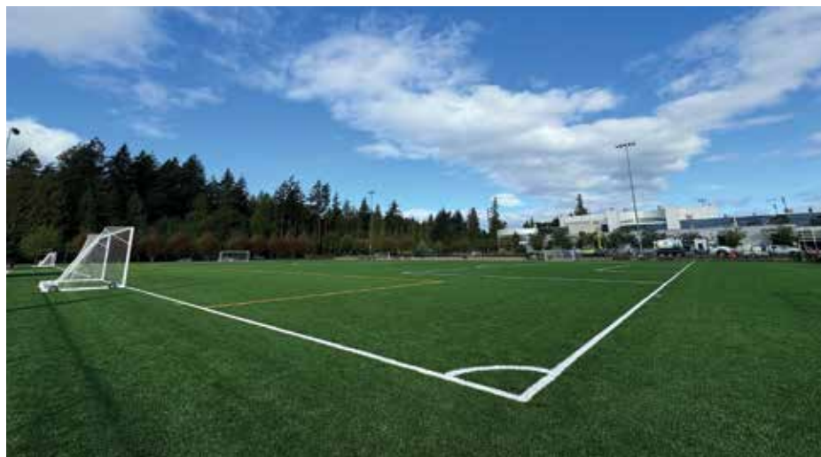
Artificial turf fields using crumb rubber infill, such as UNA Community Field (pictured here) are a source of a chemical that is lethal to salmon, UBC researchers say.

by analyzing infill samples from 12 artificial turf fields and collecting water from the fields after rainstorms.