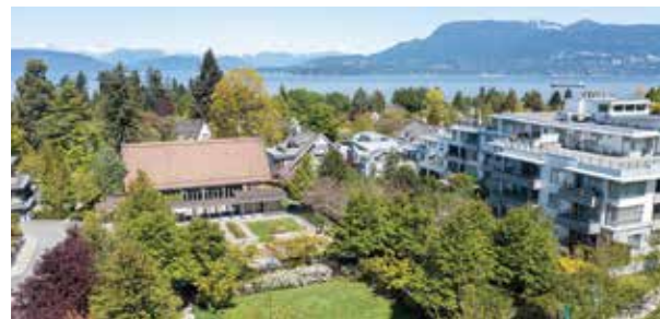
Chancellor Place, a neighbourhood on campus.

recently, a Vancouver resident sent a warning letter about entering partnerships. Essentially, when one is a minor partner joining a major partner, one will find that the latter claims to have all the experience (council members) and therefore will make all the decisions. When the dust settles, the funds will end up in the hands of that major partner, and you will be left with the experience.