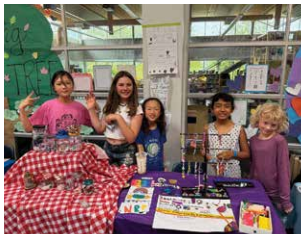
NRP students at the fair's Kids' Market, where goods made by students were available for sale.