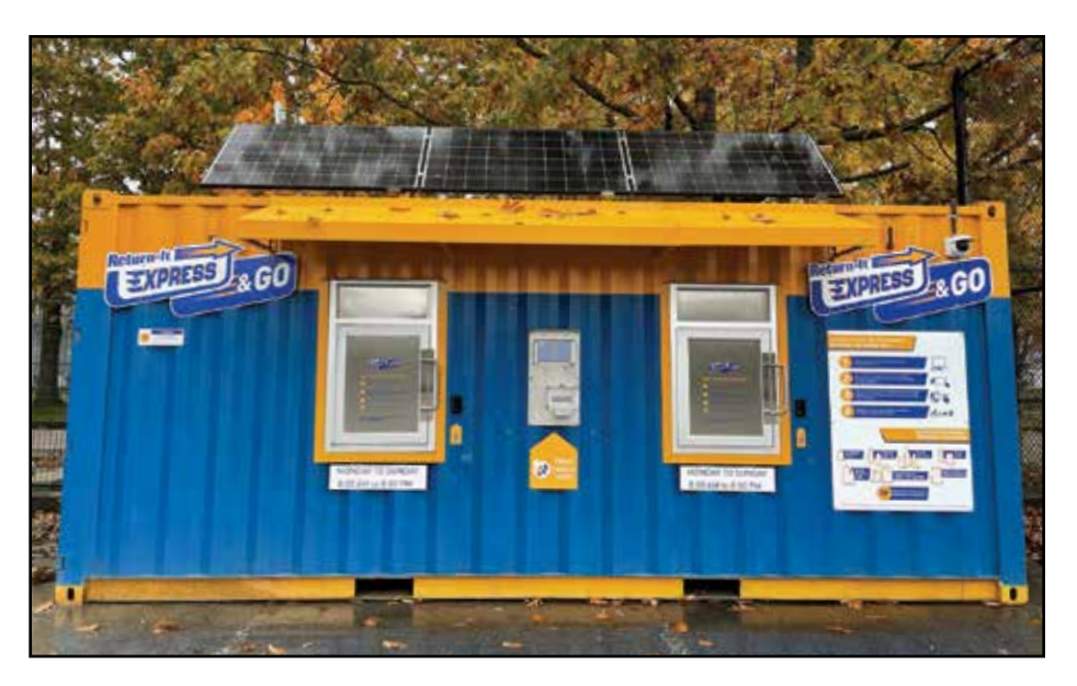
Return-It Express & GO Station on UBC Campus at 2465 Health Sciences Mall.

Through the Express & GO system, British Columbians have a contactless way