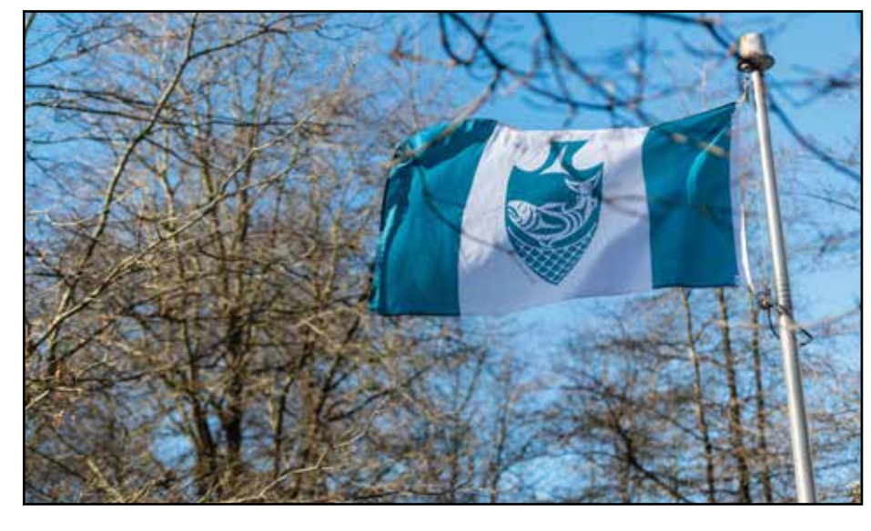
The flag of the Musqueam Indian Band is permanently raised on UBC campus.

New research suggests: Indigenous and coastal communities in Canada are increasingly finding that the ocean and marine re-