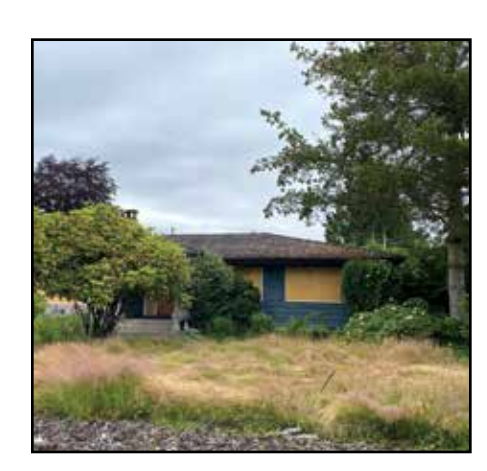
Photo taken by UEL Community Advisory Council shows UEL home that looks abandoned.

Building on overwhelming support for a prior petition to maintain the character of singlefamily areas, the CAC has asked the Minister