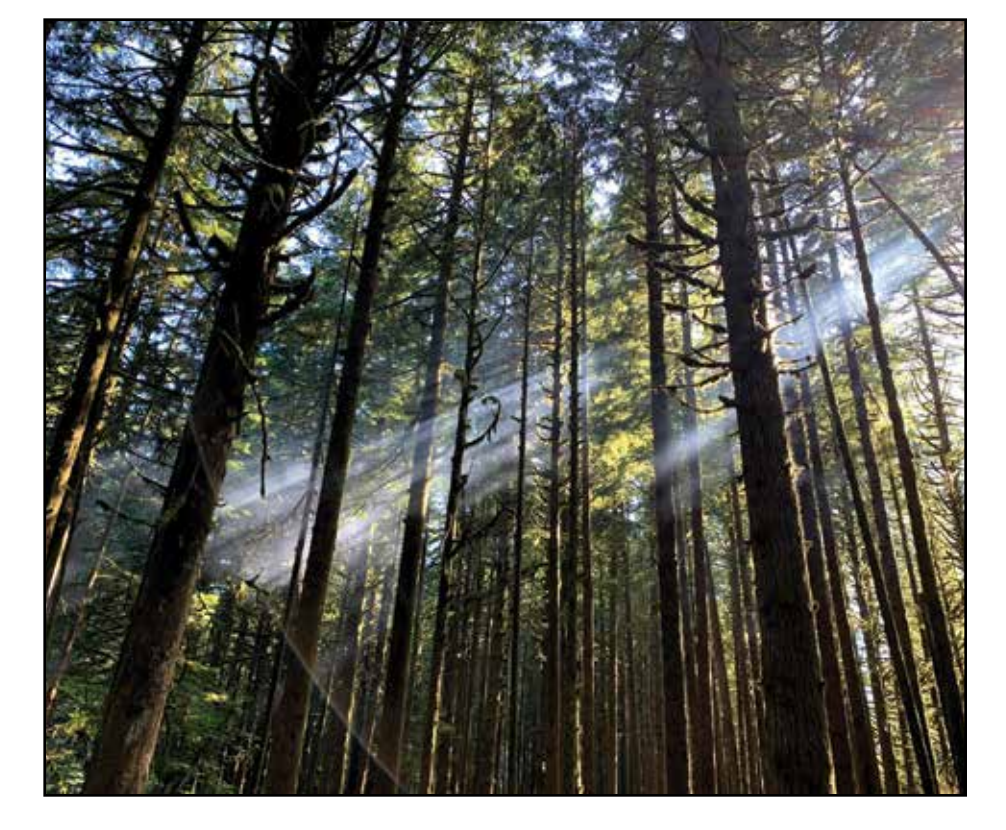
Treeline view from Cultus Lake Provincial Park.

tact, it was difficult to have the same experiences as in face to face contact. However, through voice and video calls rather than texting, we were able to recreate that social-connection feeling, and I would say that we were 99% successful in maintaining our friendship.