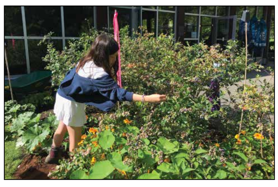
Blueberry-picking time in the Children's Garden.

The Old Barn Children's Garden is unlike the other three UNA gardens, which each have plots for individuals and families to tend (Nobel, Hawthorn & Rhodo).