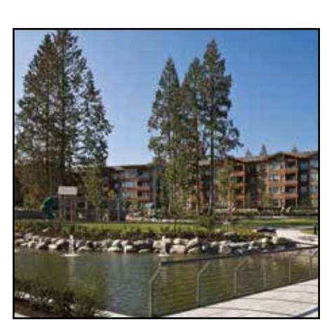
Wesbrook Place, the largest neighbourhood on UBC campus.

ing student member to participate in any open and closed session of a UNA Board Committee or Working Group, except where a conflict exists.