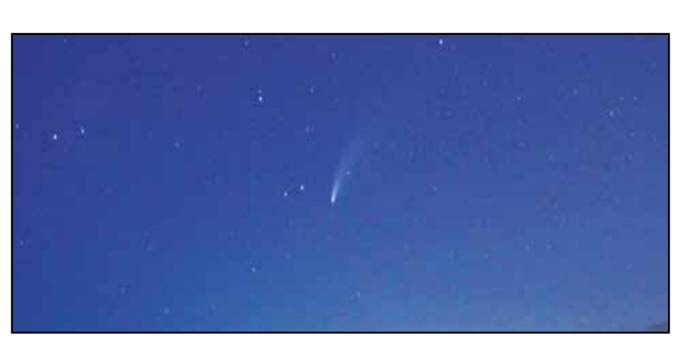
The night skyline view from Spanish Banks, featuring Comet NEOWISE.

Matin: A big problem for me was being bored and unable to manage time. I heard from many people that each day blended into the next and bland routines substituted their usual colorful days. Over time, I decided to break the cycle and make the days more interesting. As restrictions were lifted, I went camping, played basketball, balanced my homework, reading, physical activities, and communication time. Though I did have a lot of my friends' con-